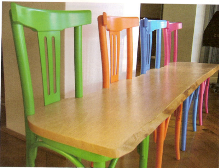
Health friendly furniture in appealing designs