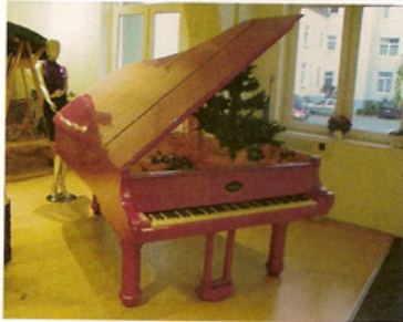
In love with old furniture

tions. Today there are partners in seven cities within ecomobel network. The latest addition is in Cologne in the Flohmarkt Halle in Mauritiussteinweg, where you can wander around 300 square metres devoted to furniture of all styles and designs.